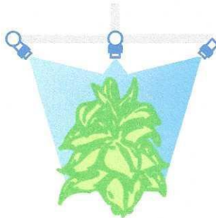
Three Spray Tips Per Row Spacing

INSECTICIDE CONTACT EXCELLENT SYSTEMIC GOOD