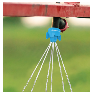
Stream integrity reduces unwanted small droplets that cause unintentional plant damage.