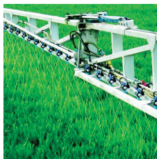
Advanced fertilizer nozzle capable of both pre and post emerge fertilizer applications.