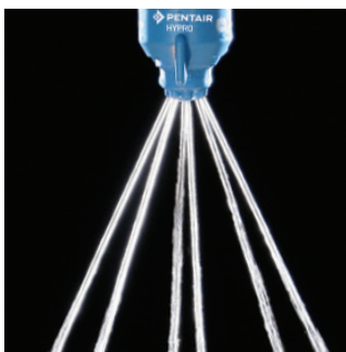
Six stream pattern in a compact design.